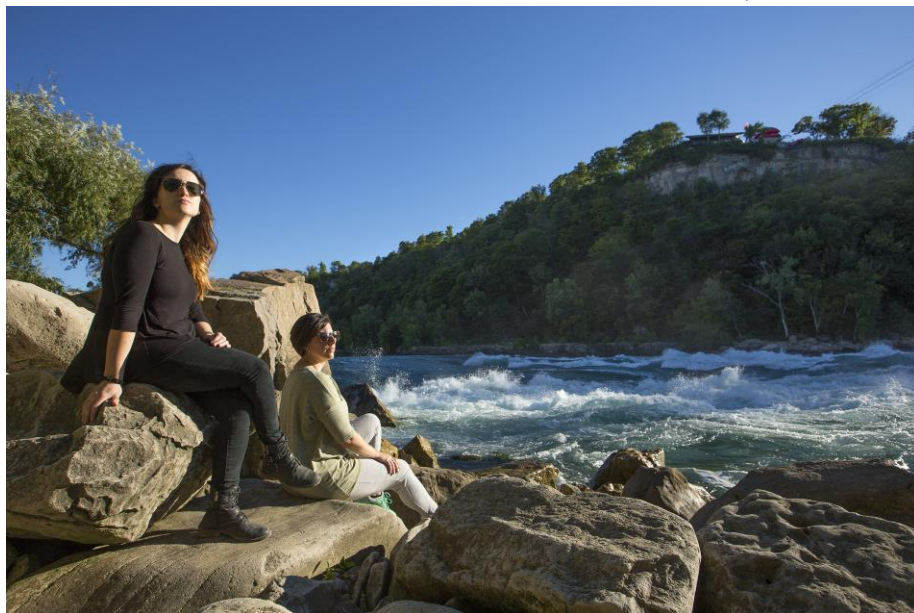
NIAGARA RIVER, NIAGARA FALLS

Over 12,000 years ago, near the end of the Ice Age, large torrents of water were released from the melting ice, draining into what is now known as the Niagara River. The water began to flow over a large cliff known as the Niagara Escarpment. It is here that the Niagara Falls first formed. Over the years, the brink had eroded, sometimes as much as six feet per year, to its present site and carved through underlying rock forming the 7-mile gorge that we see today.